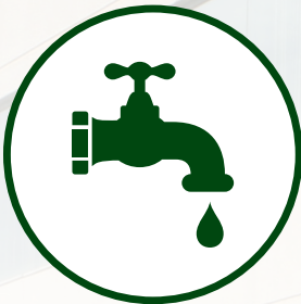
Sinks & Taps

Automatic pump system with a Category 5 AB air gap back flow protection.