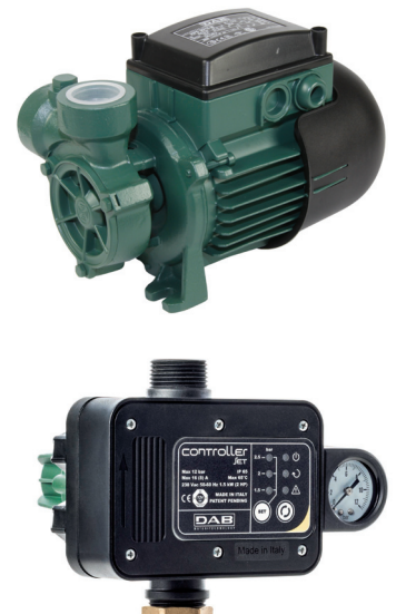
INTEGRATED TURBINE BOOSTER PUMP AND CONTROLLER

DAB PUMPS Limited Unit 4&5, Stortford Hall Ind Park, Dunmow Road, Bishops Stortford Herts CM23 5GZ